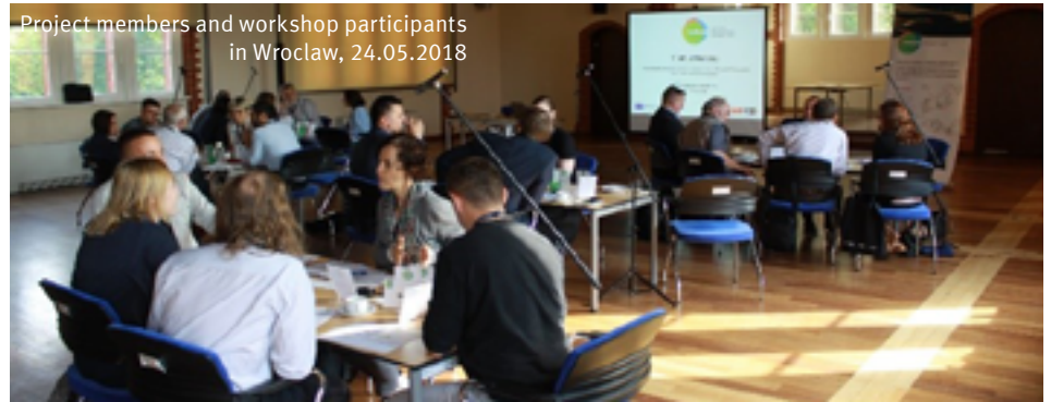
Project members and workshop participants in Wroclaw, 24.05.2018

Some insights from stakeholders around Europe