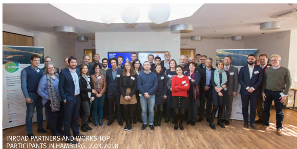
INROAD PARTNERS AND WORKSHOP PARTICIPANTS IN HAMBURG, 2.03.2018

Welcome to the Newsletter of InRoad , a Horizon 2020 project going towards better synchronisation of priority settings and evaluation mechanisms for research infrastructures beyond national relevance.